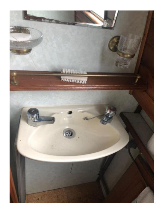
▲ Toilet - starboard