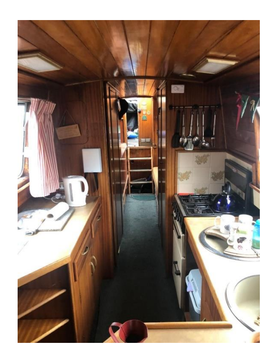
▲ Galley facing aft