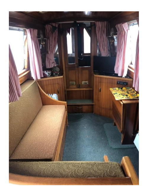
\blacktriangle Saloon facing fore