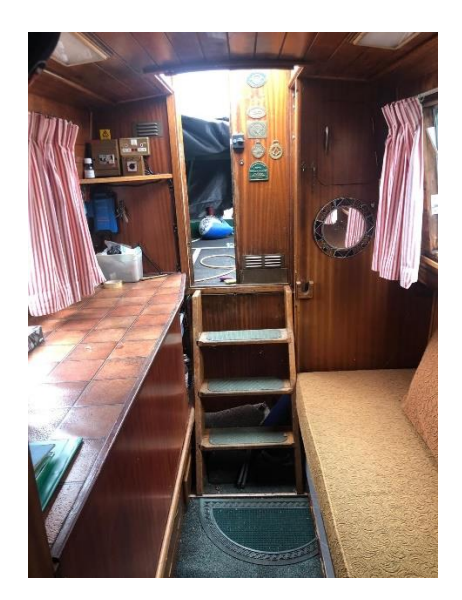
Bedroom facing aft