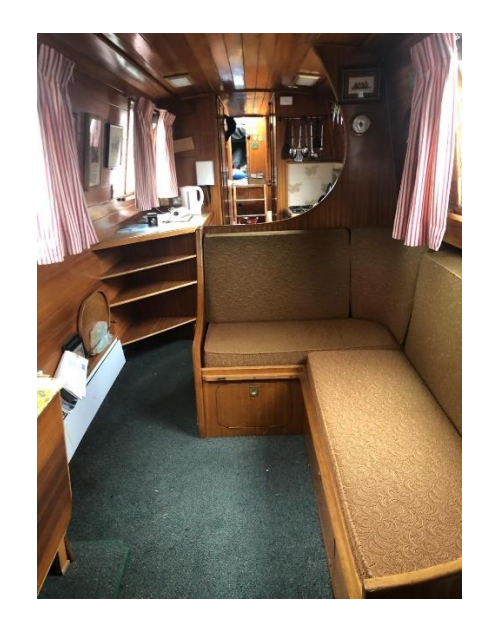
▲ Saloon facing aft