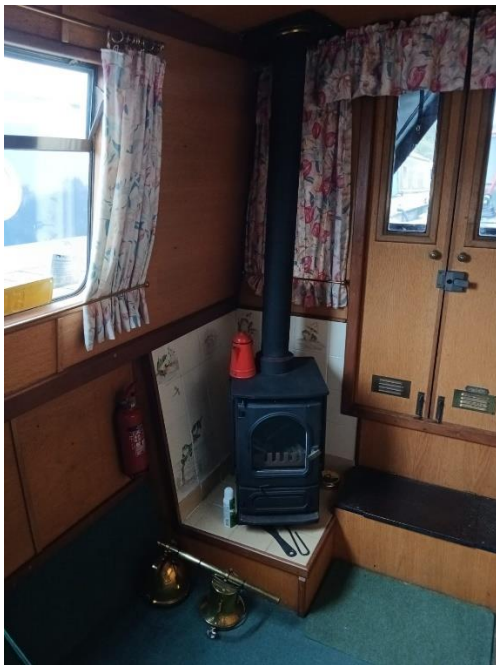
▲ Galley facing aft