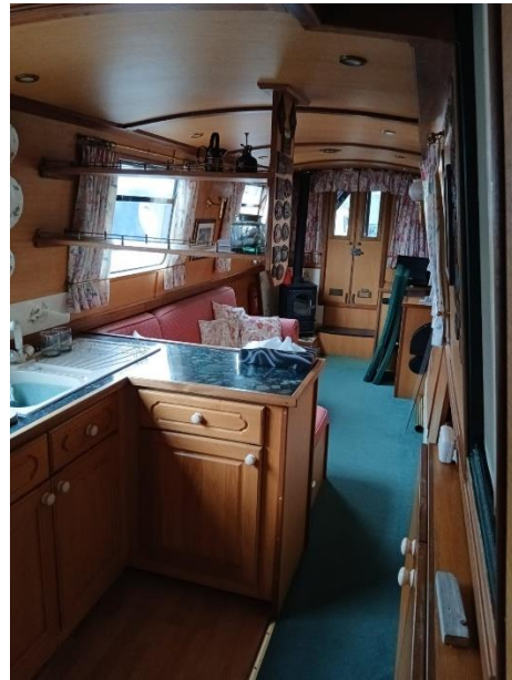
▲ Saloon facing aft