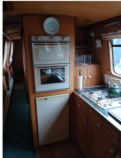
▲ Galley facing aft