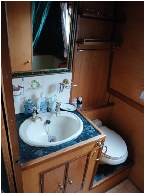
▲ Shower room facing fore