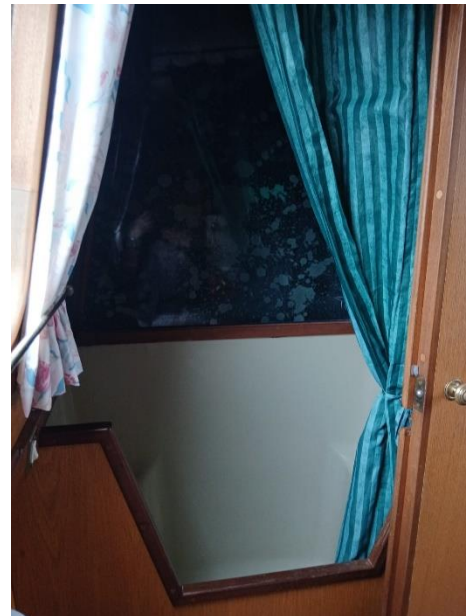
▲ Shower room