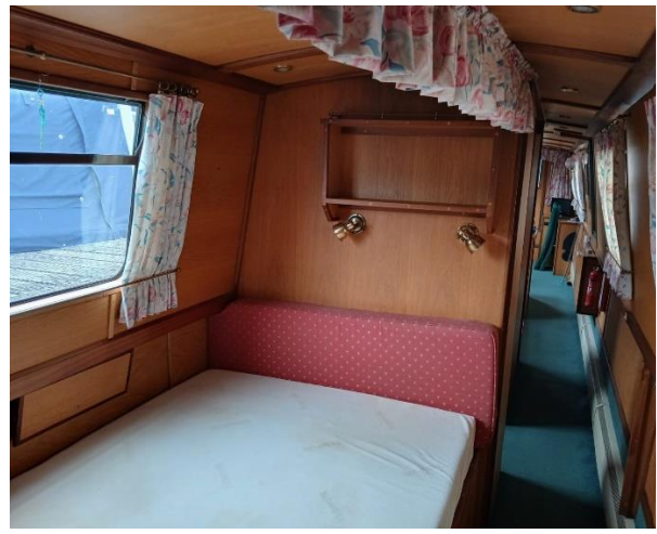
Shower room facing aft