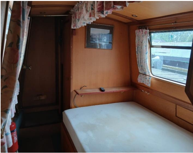
Shower room facing fore