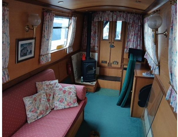
▲ Galley facing fore