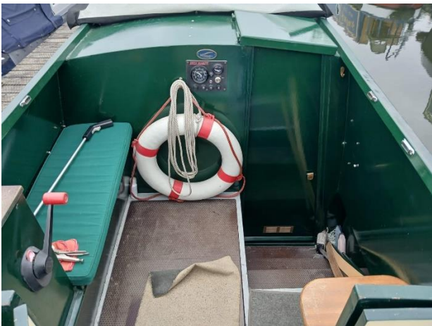
Bedroom facing fore