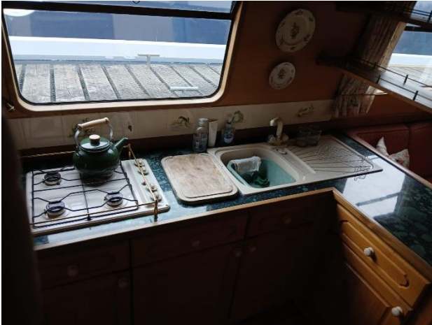
▲ Saloon facing fore