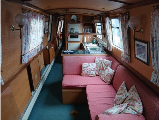
▲ Galley facing fore