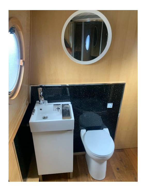
lacktriangle Shower room facing fore