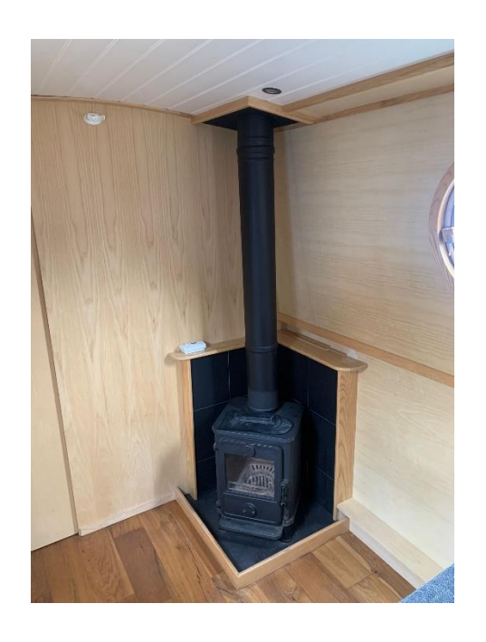
▲ Morso stovee