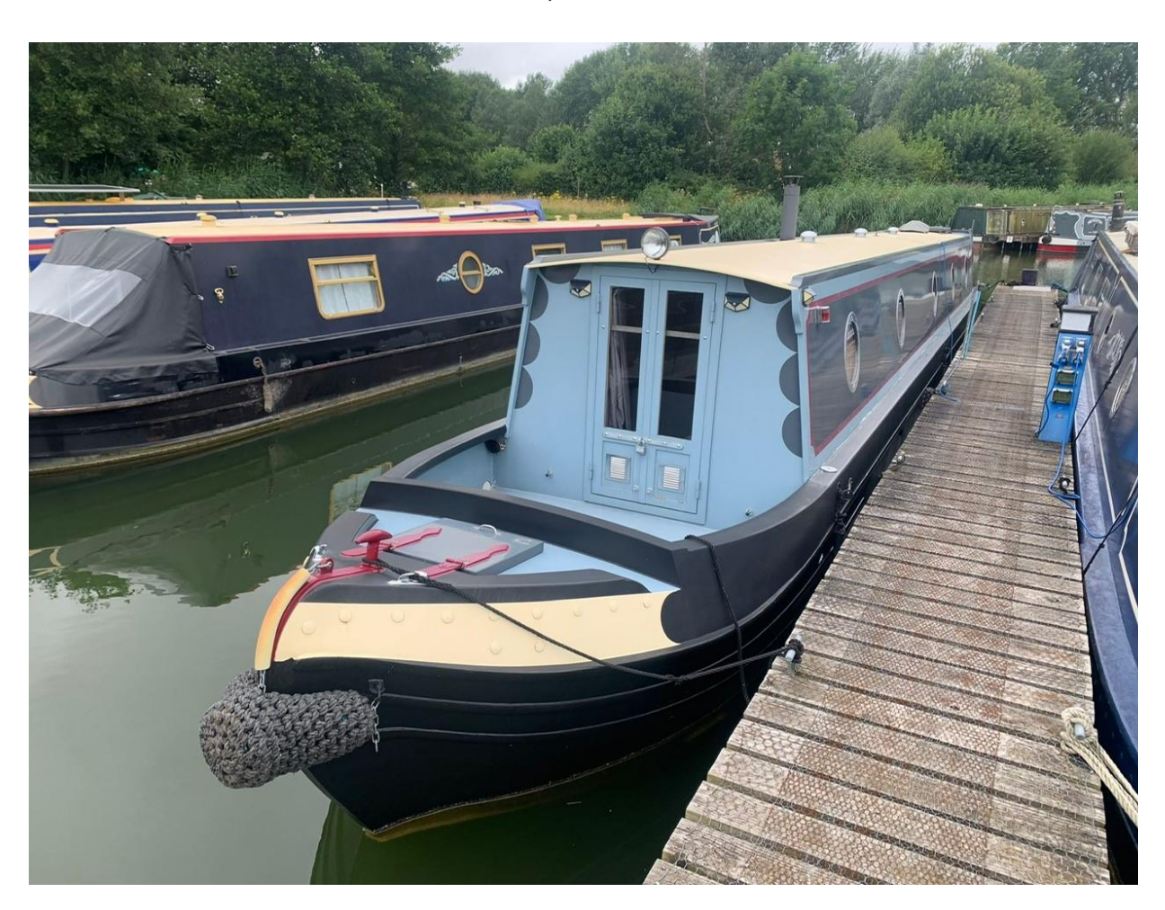
Baldrick is a 57' Semi Trad reverse layout built and fitted out by Mark Christian Boat builders in 2018. Baldrick is a lovely vessel that offers a great open feeling with a light bright interior thanks to large sized portholes and ash veneer finish. With a large galley, central saloon and walk through shower room this vessel will be ideal for a continuous cruiser or a comfortable leisure vessel ready to make the most of the canal network.