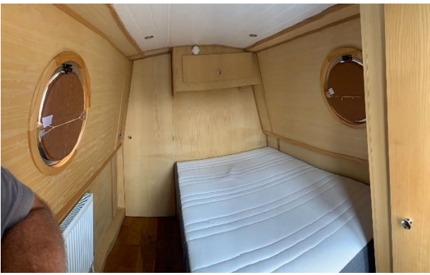
Bedroom facing fore