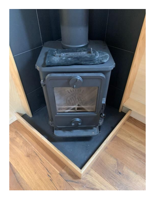
▲ Facing fore