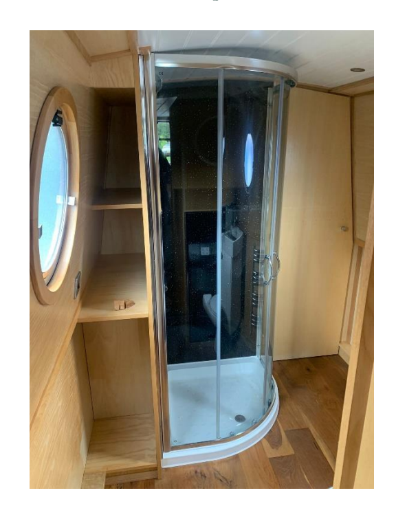
lacktriangle Shower room facing aft